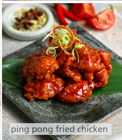
ping pong fried chicken