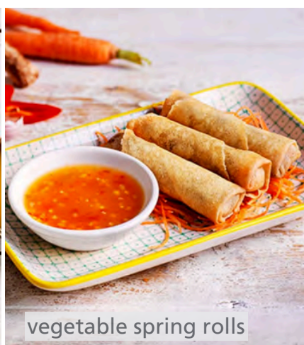
vegetable spring rolls