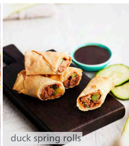
duck spring rolls