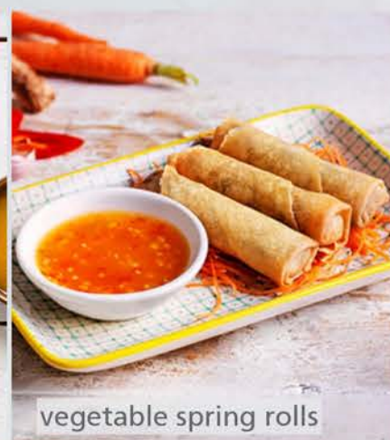
vegetable spring rolls