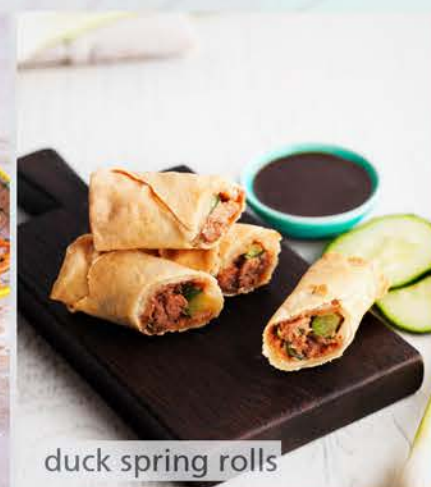
duck spring rolls