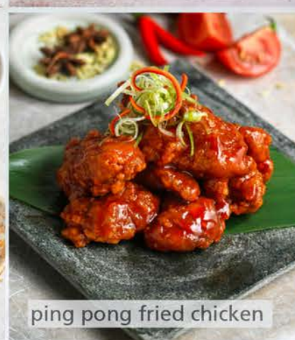
ping pong fried chicken